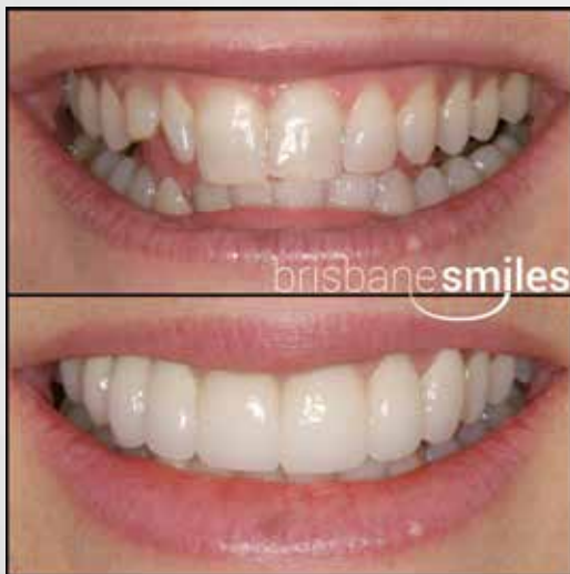
Dis-proportionate Teeth Shapes with uneven and small presentation was corrected with Six Emax™ Porcelain Veneers.