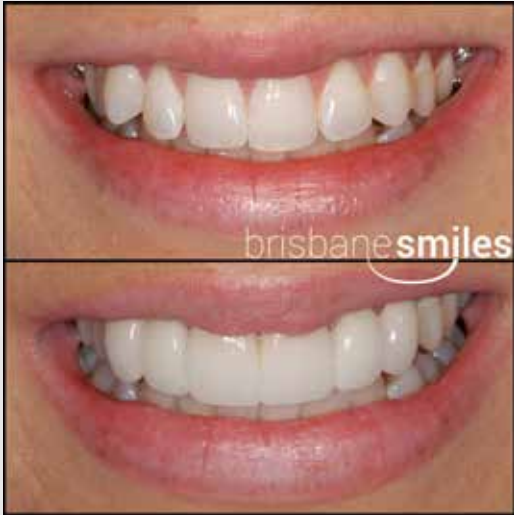
Mild Teeth Crowding was corrected with Six Emax™ Porcelain Veneers