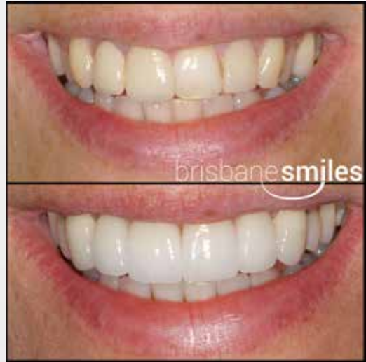
Mild Teeth Discolouration was corrected with Six Emax™ Porcelain Veneers. The Lower Teeth were whitened with Zoom™ Teeth Whitening

Actual patient results. Individual Results may vary.