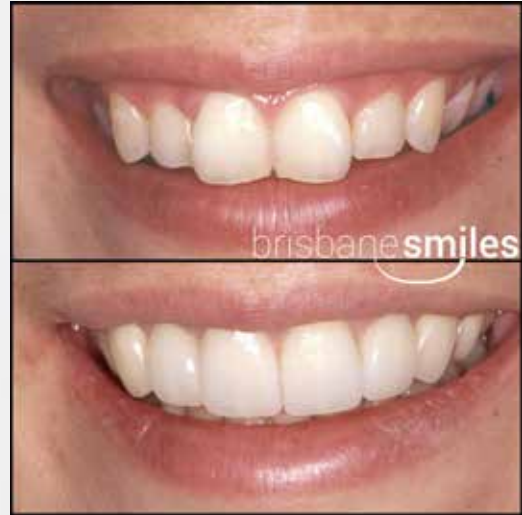
Mild Teeth Crowding with worn teeth was corrected with Eight Emax™ Porcelain Veneers.