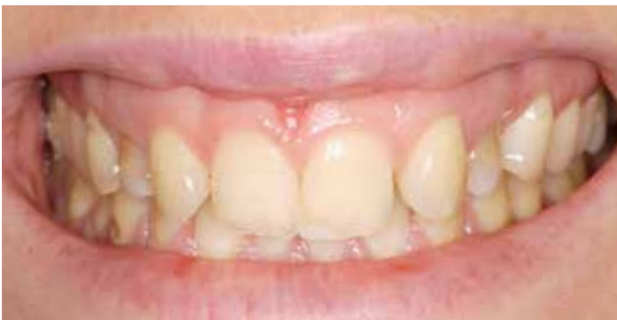
After Cosmetic Dentistry