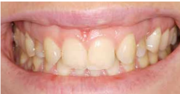
After Cosmetic Dentistry