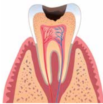
Stage Two Tooth Decay