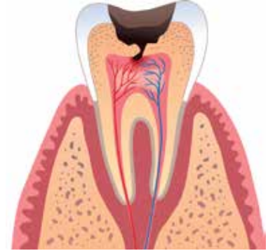
Stage Three Tooth Decay