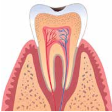
Stage One Tooth Decay

Stage Three Tooth Decay: Tooth is extremely sensitive, tooth aches or is sore to pressure, needs Root Canal Treatment